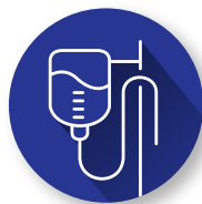
Diluted drug solution